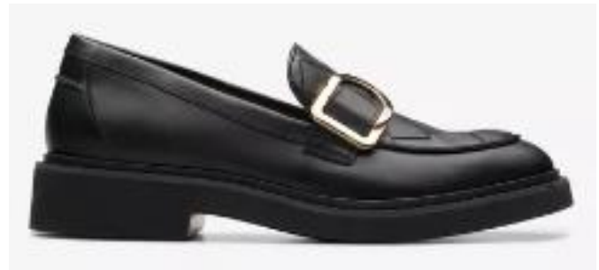
A small simple buckle is acceptable