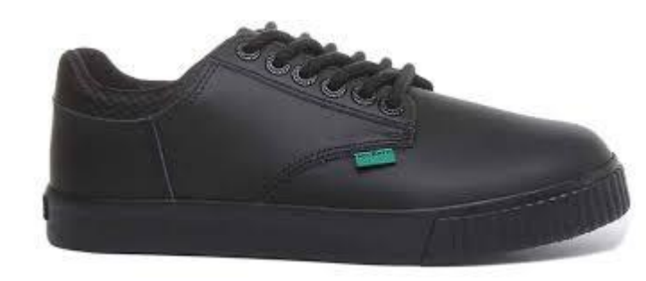
The only colour we do allow are the very small 'KICKERS' tags