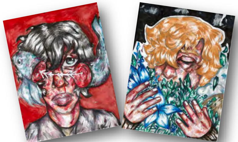
Starr-Blu 10.1 'It's Just Art, Innit'