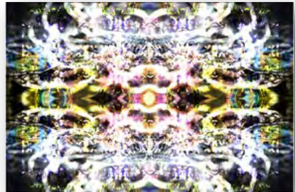
Bhavya 11.4 'Light'